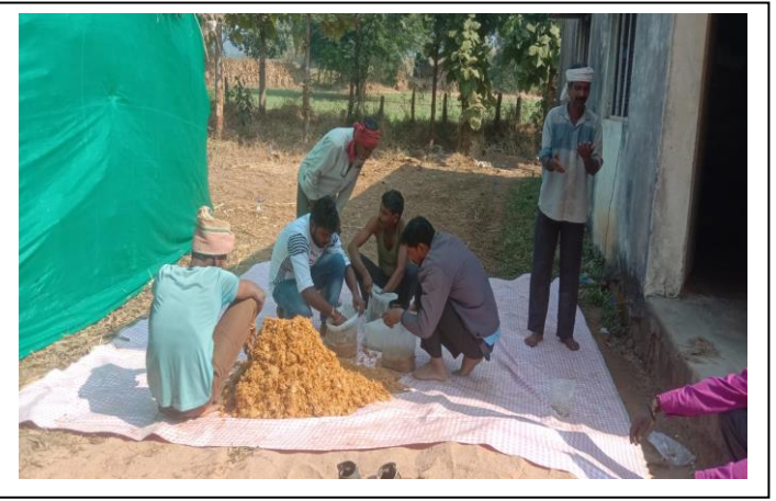
Utilization of paddy straw waste for mushroom cultivation