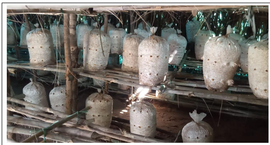
Oyster mushroom cultivation growing

Under Green India Mission of Oyster mushroom cultivation with four model mushroom production units were introduced under the farmer's first programme among the tribal community in the Forest area is located in the West Betul Forest Division in Range " chicholi " in the selected Village Forest Committee, Imlidhoh and others villages of Madhya Pradesh to help the farm women and the young rural youth in the area to have a sustainable livelihood.