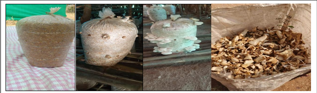
Training organized under farmer first programmed mushroom cultivation & farming.